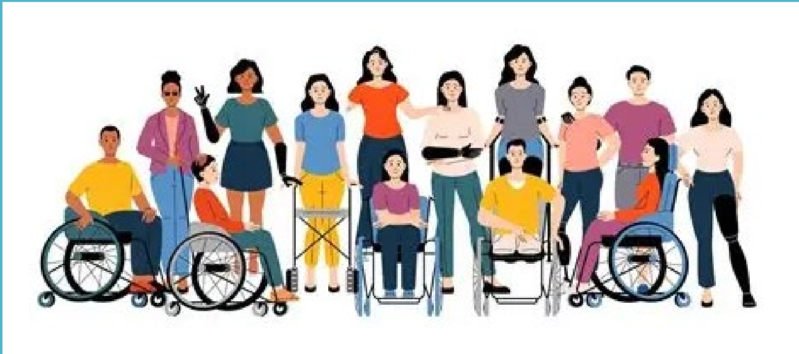
Image: Variety of Community members, including people in wheelchairs and walkers.

Your community is where you live, work and play. The people who make decisions there affect you every day. Getting involved and developing relationships with the decision-makers and your neighbors is a great way to make a difference and be a part of solving issues and concerns that potentially affect everyone.