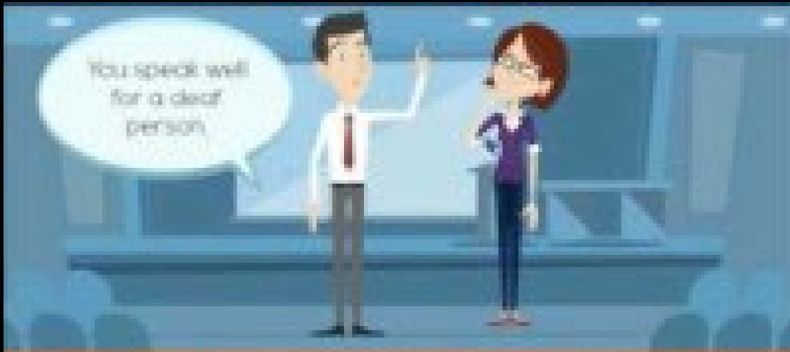
AUDISM #4 - PATRONIZING DEAF/HOH ABILITIES